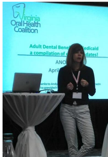
Learning about current status of