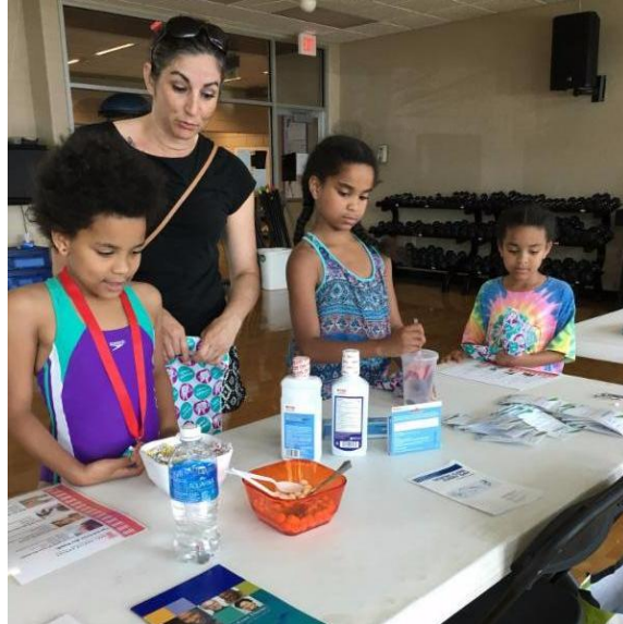
A family visits the OHK table and discusses oral health practices with staff

practices and healthy ways to deal with dry mouth conditions. They also learned how to choose foods healthy for teeth and which snacks and beverages put teeth at risk for cavities.